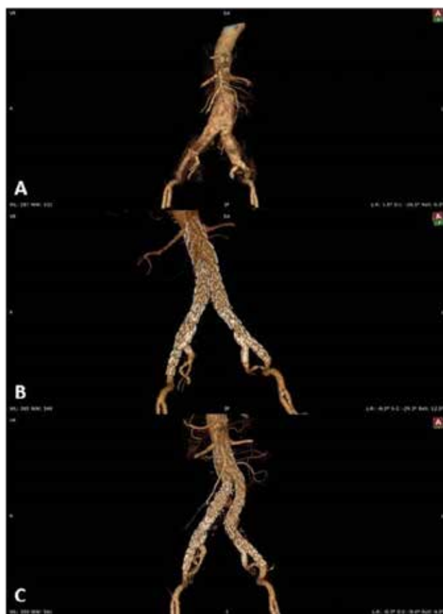
Figure 1. 3D imaging of the patient with bilateral IBG

IIA: Internal Iliac Artery, OSR: Open Surgical Repair