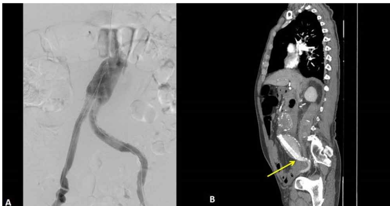
Figure 2. The patient with bilateral IBG and persistent Type 2 endoleak which was embolised with coil A: Angiographic view showed no endoleak B: Control CTA two days later with Type 1b endoleak Yellow arrow showed stent-graft migrated from distal landing zone