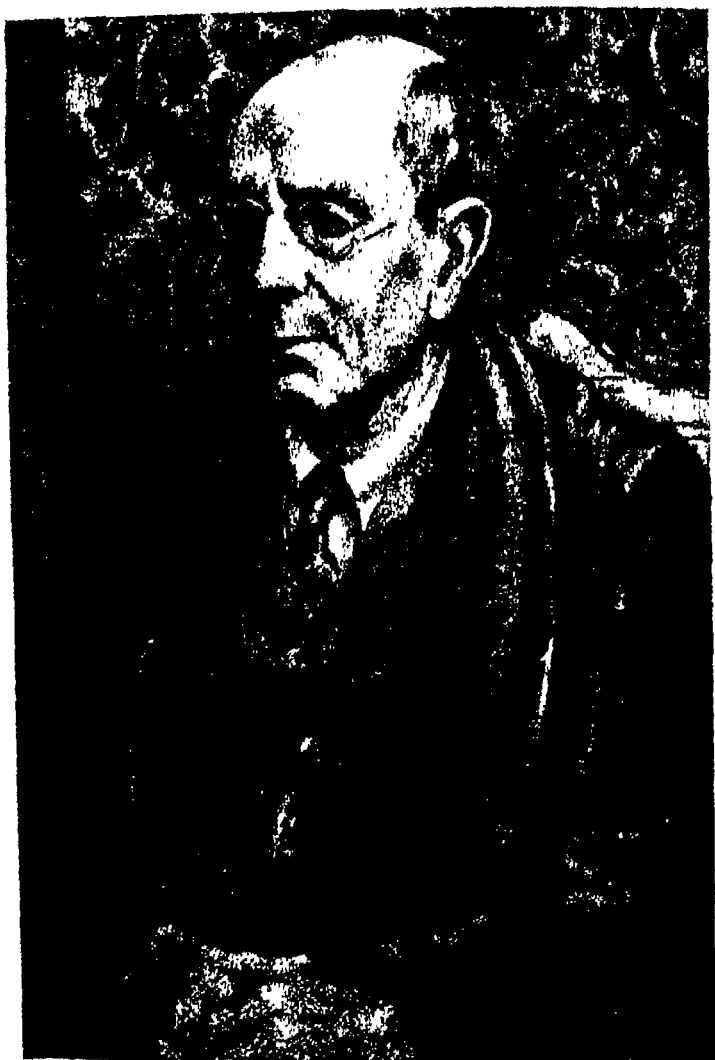
G. L. D.